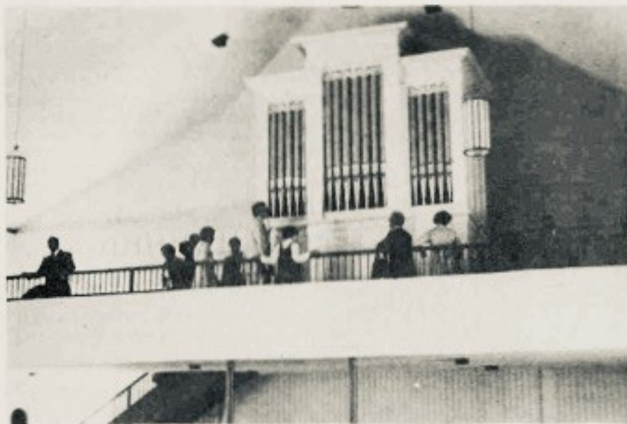
The 1850 vintage Stevens tracker-action pipe organ at Gloria Dei.

The new building together with the parish hall is located in Charleswood in the southwest corner of the city. Standing on an acre of ground, this present sanctuary was designed by