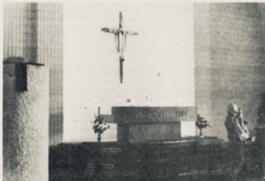
The Chancel of Gloria Dei Church, Winnipeg.

Following the Festival Service, a sit-down dinner was held in the parish hall served by the members of the ELCW. The head table was flanked